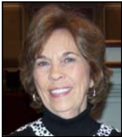
Betty White by letter